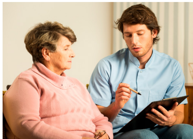
A variety of studies link obesity in midlife to lower cognitive function and increased dementia risk in old age. But obesity after age 65 appears to provide some protection from dementia.

To explain the relationship between midlife body fat and later life mental function, a number of researchers say we should look to childhood. Preliminary analysis by Herd and Dowd (2016) suggests that midlife obesity and late-life cognitive function are both “a function of early life factors.” They show that the link between midlife obesity and mental decline can be explained when childhood characteristics are taken into account—parental socioeconomic status, adolescent IQ, and educational attainment (factors that tend to be interrelated). These childhood factors influence both obesity and cognitive function later in life, they argue. Their findings are based on data from the Wisconsin Longitudinal Study, which has tracked a cohort of predominantly white high school graduates for 60 years.