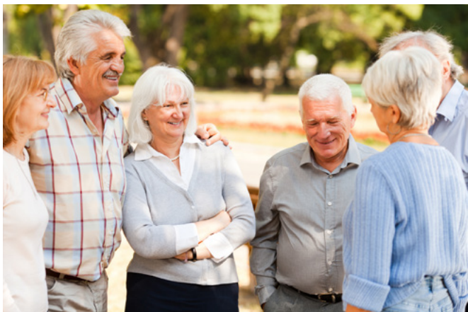
A growing share of older Americans are spending less of their lifetimes with cognitive impairments.