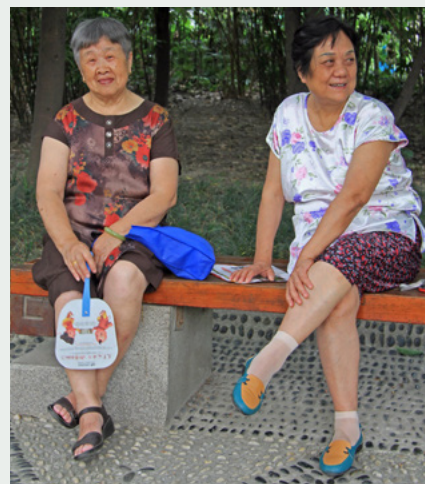
In low- and middle-income countries today, dementia risk among older adults is shaped by the amount of schooling they received during youth, particularly for females.

Globally, more than half (58 percent) of people with dementia are living in low- and middle-income countries (WHO 2012). By 2050, this share is expected to rise to more than 70 percent. WHO reports that dementia tends to be "absent from or low on the health agendas" of low- and middle-income countries. WHO urges countries to focus on improving early diagnosis, raising public awareness about the disease, reducing stigma, and providing better care to people living with dementia and more support to their caregivers.