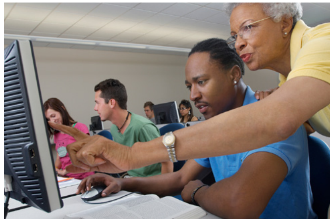
Older workers with complex jobs were most able to preserve their cognitive performance in the face of Alzheimer's-related brain changes.

Education may directly affect brain development by creating stronger connections among brain cells that older adults can draw upon if their memory or reasoning ability begins to decline.