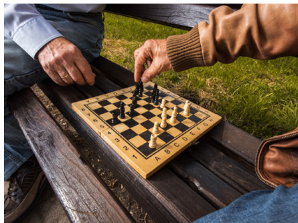
Researchers are investigating the complex relationships among education, intellectual stimulation, brain development, and cognitive health in old age.

Other recent research further underscores the complex relationships among education, brain development, and cognitive health in old age. A large international study identified genes (74 areas of the human genome) associated with educational attainment, suggesting that the amount of brain-protecting schooling people acquire could be partially predetermined by the genes they inherit (Okbay et al. 2016). Other studies suggest that differences in cognitive function and physical activity already evident in childhood can shape cognitive function in late life (Belsky et al. 2015; and Belsky 2016). In low-income countries, the number of people with dementia is rising, in part reflecting population aging and low levels of education, particularly among older women (see Box 1).