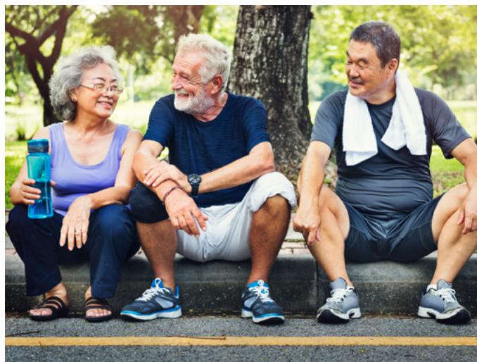
Increased physical activity and blood pressure control for those with hypertension are two interventions that may lower dementia risk.

Other studies find older U.S. Hispanics living in East Coast cities and in southern California tend to develop dementia several years earlier than their U.S. non-Hispanic white counterparts (Livney et al. 2011; Fitten et al. 2014). In the California study, these differences remained even after the researchers controlled for education levels, dementia severity, and health risk factors (high cholesterol, high blood pressure, and diabetes). Because the Alzheimer’s-linked APOE e4 gene appeared less frequently in Hispanics than the non-Hispanic whites in the study, they speculate that other genetic or environmental risk factors play a role in earlier dementia onset among Hispanics. The researchers note that if identified, environmental risk factors can be prevented and possibly reversed.